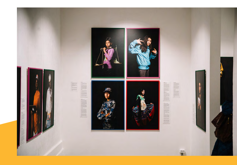
Vincent Tremeau's photo exhibition "One Day I Will" at The Juhan Kuus Documentary Photo Centre, autumn 2020 (2)