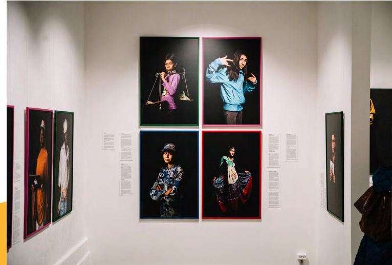
Vincent Tremeau's photo exhibition "One Day I Will" at The Juhan Kuus Documentary Photo Centre, autumn 2020 (2)